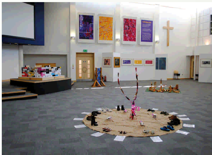
Exhibition at Danbury Mission, Essex