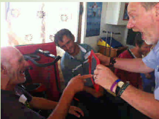
Above: 'You are beautiful'. A simple mirror delights an elderly resident of a home in Korçe.

much about the most effective way of complementing each other's gifts and ways of communicating. As a result I just feel SO comfortable working with her. And with all the 'Fierce Love' material to draw upon when appropriate, well, I'm also anticipating