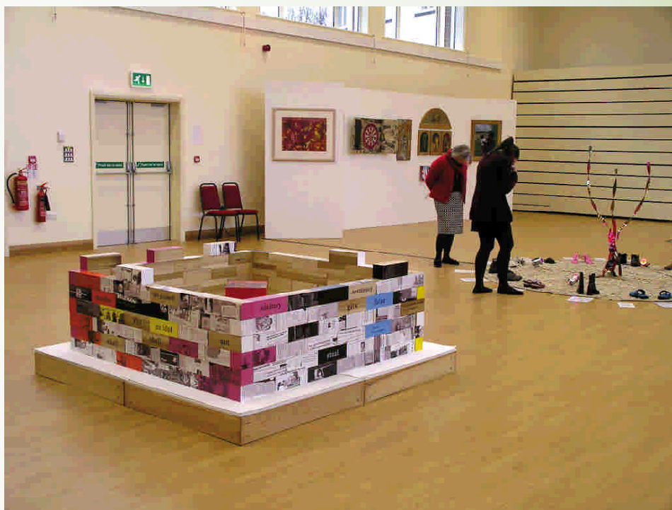
Exhibition at Harrogate Ladies College